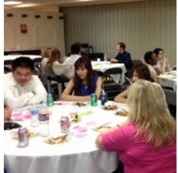
Students and professionals gathered at the open board meeting on September 10, 2013.

We really appreciate everyone who came and the ideas they shared. With new ideas aplenty and enthusiastic members, this is bound to be a successful year for the Cactus Section of IFT.